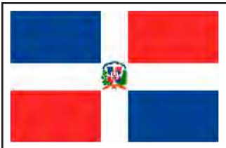
Dominican Republic National Team