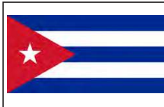
Cuban National Team